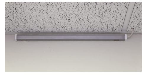
11. Connect to DC power.