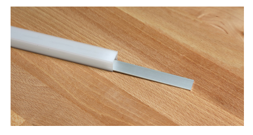
The aluminum bar holds the tape light while it slides into the channel cover.