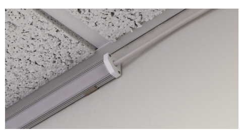
Use a ruler to place the mounting clips (included) near the location of the ends of the channels.