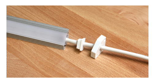
Insert the power wire through the open silicone and plastic end caps before attaching to the DC power supply.