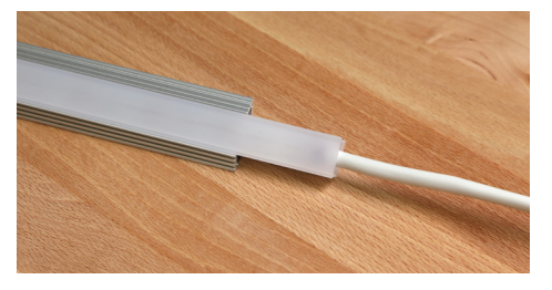
Slide the cover / bar / tape light into the aluminum channel.