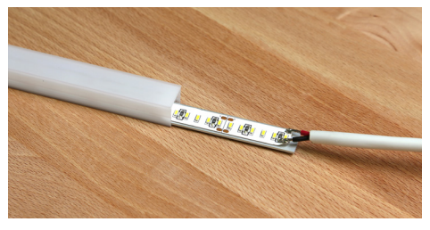
4. Peel off the covering of the tape light's adhesive backing and press the tape in a straight line on the bar, working from one end of the channel to the other to ensure flat, even adhesion. Slide the aluminum bar with tape light mounted into the channel cover.