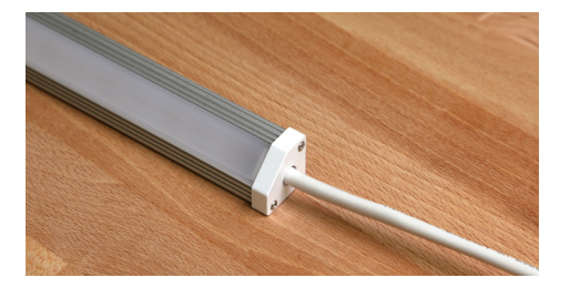
Insert the plastic end caps into the ends of the channel with even pressure on both sides. Secure the end caps with the included capsure.